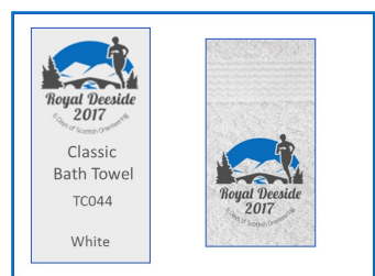
Classic Bath Towel TC044 White