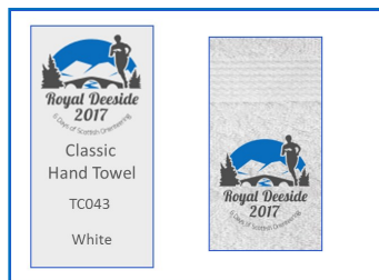
Classic Hand Towel TC043 White